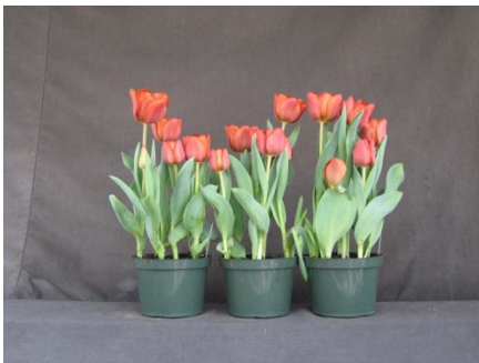
17 wks cold; in grnhse 5 Feb Jan. (0436)