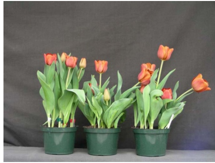
17 wks cold; in grnhse 27 Feb. (2135)