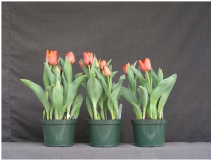
15 wks cold; in grnhse 23 Jan. (0771)