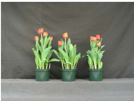
16 wks cold; in grnhse 13 Feb (1790)