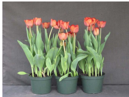
23 wks cold; in grnhse 16 Mar. (0800)