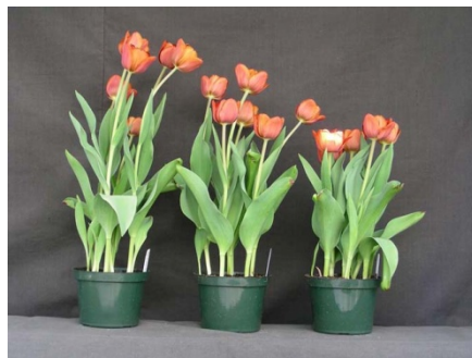
23 wks cold; in grnhse 10 Apr. (3005)

Effect of cold-weeks and paclobutrazol (Piccolo) drenches on appearance of 6" 'Cairo' tulips. Cold duration varies between panels from 13-24 weeks. In each panel, L to R: Control, 1 and 2 mg Piccolo applied as a soil drench 1-3 days after placing in the greenhouse. Experiment 2006-T1.