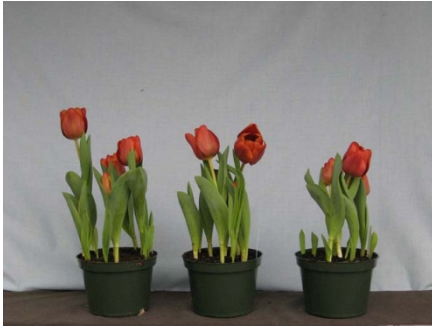
14.5 wks cold; in grnhse 7 Jan. (0010)