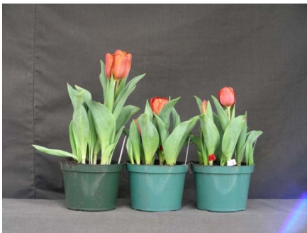
14 wks cold; in grnhse 9 Jan. (0586)