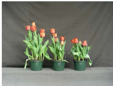
19 wks cold; in grnhse 13 Mar. (2418)