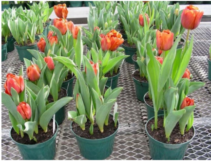
13 wks cold; in grnhse 26 Dec. (0364)