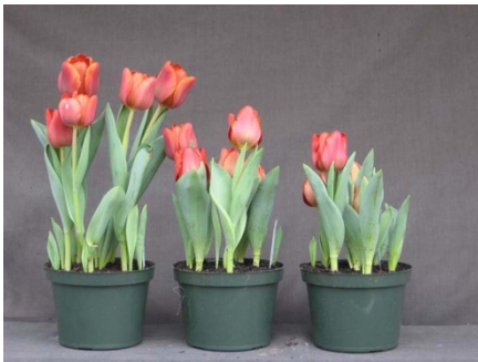
16 wks cold; in grnhse 22 Jan. (0115)