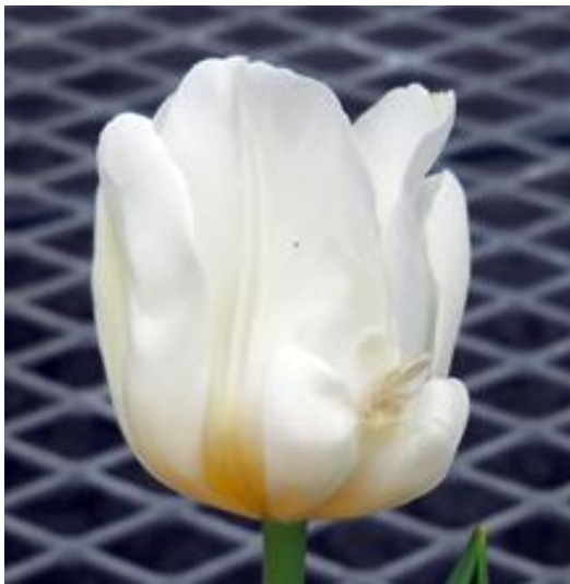
Fig. 1. Note distorted petal tip that failed to grow. Image 9189

Figs. 1-4. Some symptoms of ethylene exposure to bulbs (in October, in Ithaca). Bulbs were exposed to ethylene at 20C for 2 weeks in October in Ithaca. After ethylene exposure, bulbs were held at 17C, then planted and cooled at 9C for 27 weeks (temperature was reduced as needed to prevent excessive shoot growth), then forced in a 17C greenhouse.