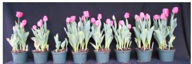
1 week 25C Image 5455