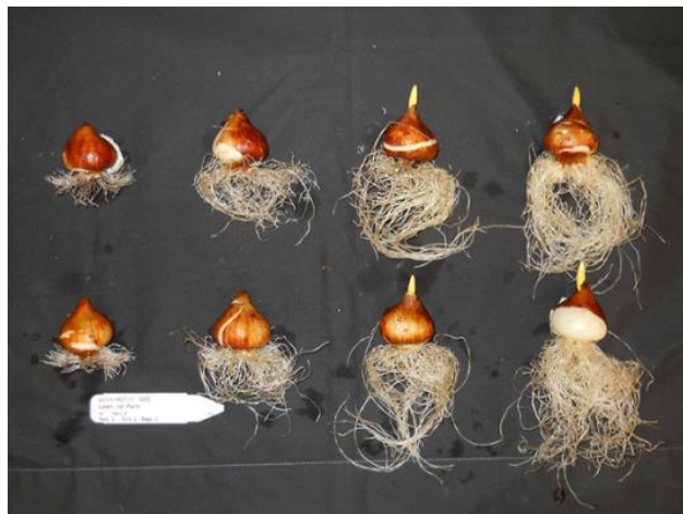
Fig. 9. Tulip Leen vd Mark planted and held about 60 days at (L to R): 1, 4, 7, 10C (33, 40, 50 or 50F). Image 7621.