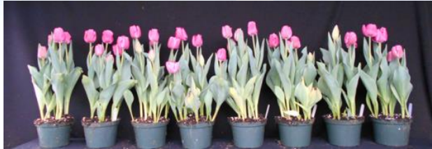
1 week 20C Image 5454

The photos show Carloa in 6" pots. The control was bulbs held dry at 17C until planting and placed immediately into 9C. The 4 treatments were to plant the bulbs in pots, water them in and hold for 1 week at 15, 20, 25 or 30C. After treatment, pots were transferred to 9C for cooling. The controls were planted and put into 9C on the same day and all plants started their cold period. Note the uniformity of the controls compared with the overall variability and increasing leaf yellowing and disease problem as temperature increases. This shows importance of planting into cool soil and has direct application for both forcing and landscape customers. Conclusion? Delay planting into landscape sites until soil temperature is at least under 15C, and preferably lower. If possible, cover beds with a 1-2" layer of mulch to help keep soils cooler after planting.