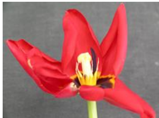
Fig. 4. Note aborted anthers (thin, dried-up "threads" and 1 normal anther. Image 9156