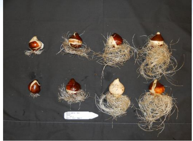
Fig. 10. Tulip Oscar planted and held about 60 days at (L to R): 1, 4, 7, 10C (33, 40, 50 or 50F). Image 7620.