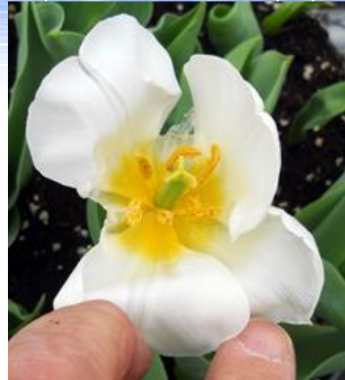
Fig. 2. Note distorted petal remnant on left and distorted anthers. Image 9193