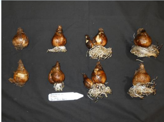
Fig. 7. Narcissis Primeur planted and held about 60 days at (L to R): 1, 4, 7, 10C (33, 40, 50 or 50F). Image 7619.