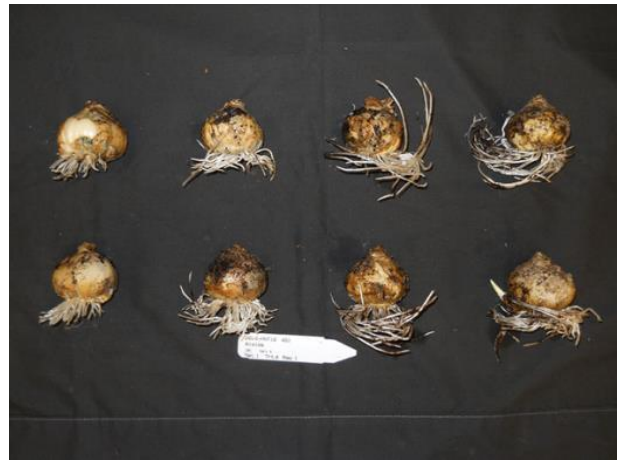
Fig. 5. Hyacinth Aiolos planted and held about 60 days at (L to R): 1, 4, 7, 10C (33, 40, 50 or 50F). Image 7622.

Conclusion? If you have tulips and want to reduce root growth then lowering the temperature after roots are pushing out of the holes is a good practice. However, if you put late planted crops into this same cooler, whether they are tulips, hyacinths or daffodils, they will root very slowly or not at all. Be aware of this as you are managing your planting schedules and coolers.