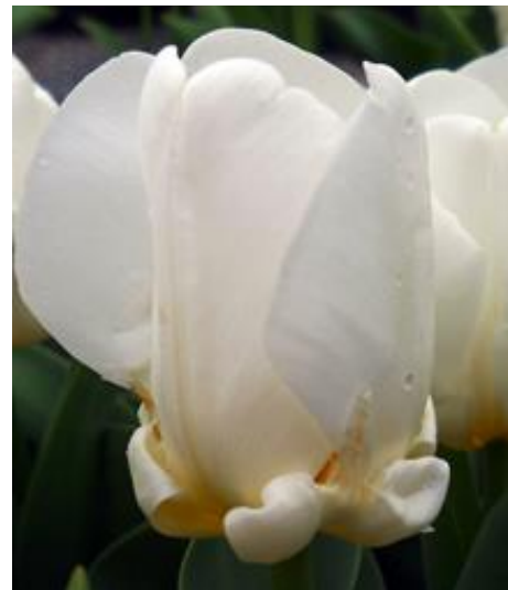
Fig. 3. Note distorted petal tissue that failed to grow. Image 9194