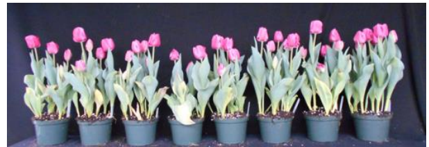
1 week 30C Image 5456