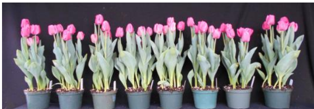
Control (9C) Image 5452