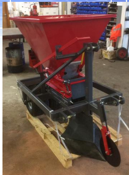
Example of a single-row (18" wide) in-grass bulb planting machine that can be mounted on a small (25-30 hp) tractor. This machine can plant thousands of bulbs in just a few minutes into established grass, leaving the grass intact.

Another opportunity is for bulbs to play a key role in allowing part of a large swath of turfgrass to become a slightly less maintained area, with less mowing. Doing so will increase pollinator, butterfly and beneficial insect diversity, will reduce CO2 emissions from less passes with a mower, while providing early season color and continuing interest from late blooming bulbs. A win-win for everyone!