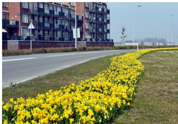
Example of the flowering result of undergrass planting