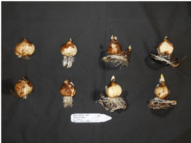
Fig. 8. Narcissus Tete-a-Tete planted and held about 60 days at (L to R): 1, 4, 7, 10C (33, 40, 50 or 50F). Image 7618.