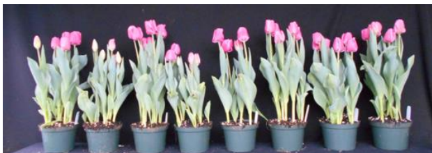
1 week 15C Image 5453