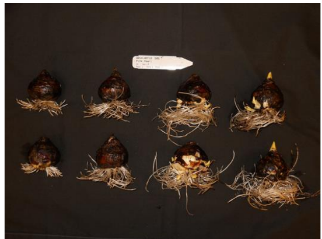
Fig. 6. Hyacinth Pink Pearl planted and held about 60 days at (L to R): 1, 4, 7, 10C (33, 40, 50 or 50F). Image 7617.