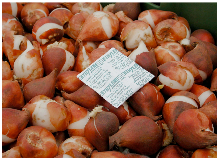
Figure 1. A shipment of tulips received in North America with a sachet of Ethylene Control (potassium permanganate) included. This 7 gram sachet can absorb about 6,500 ul (6.5 ml) of pure ethylene.

The other major technology that will hopefully soon impact the tulip industry is 1-MCP (otherwise known as EthylBloc, SmartFresh, or FreshStart). Research continues to be conducted on this material with tulips, and the indications are all favorable as to its effectiveness in protecting bulbs from ethylene injury . That is, after treatment with 1-MCP, tulips are immune from ethylene, at least for a period of 2-3+ weeks, depending on cultivar, ethylene level, time of year, etc.