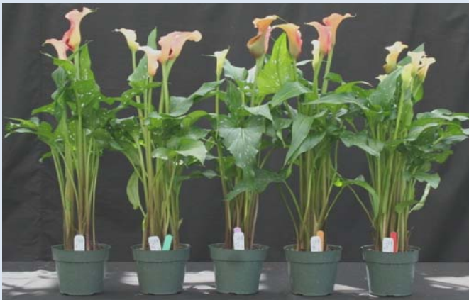
Figure 3. Effects of PGRs on 'Mozart'.

Left to Right Control, 0.5ppm Topflor, 1 ppm Topflor, 1.5ppm Bonzi, and 3 ppm Bonzi. One representative plant from each treatment is shown.