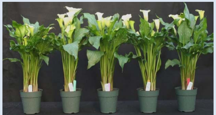
Figure 6. Effects of PGRs on 'Captain Eskimo'.