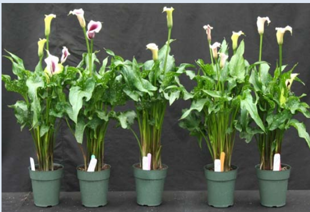
Figure 5. Effects of PGRs on 'Picasso'.