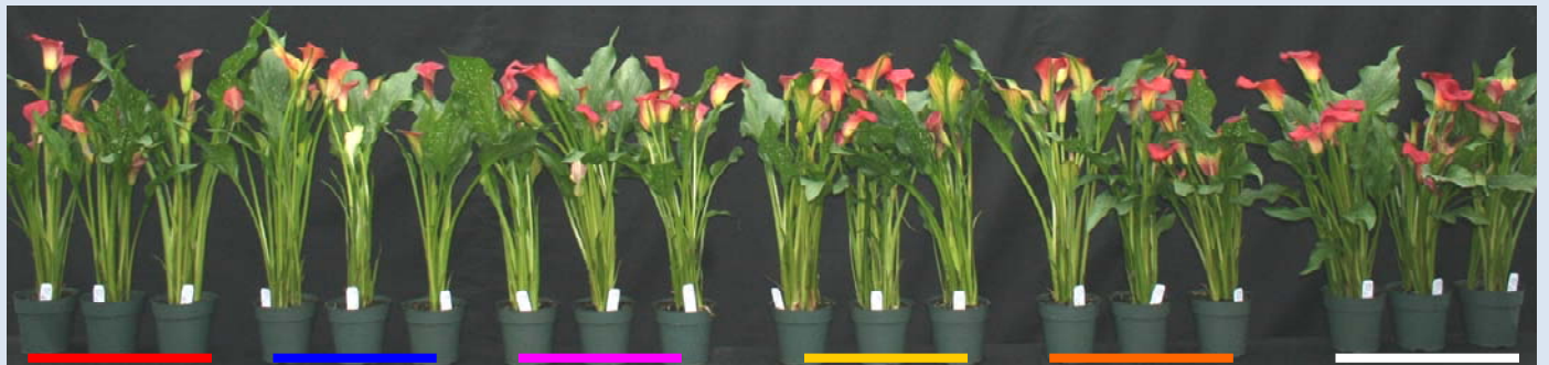
Figure 2. Effects of media type on 'Red Sox'. Left to right: MM360 (control; red), 1-PV (blue), Perennial Mix (purple), LC1 (yellow), MM560 (orange), and MM300 (white). Three representative plants of each treatment are shown.

Left to Right Control, 0.5ppm Topflor, 1 ppm Topflor, 1.5ppm Bonzi, and 3 ppm Bonzi. One representative plant from each treatment is shown.