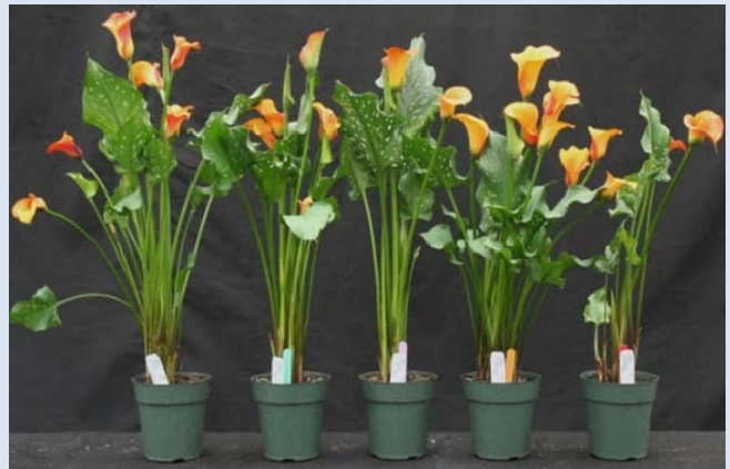
Figure 4. Effects of PGRs on 'Hot Shot'.