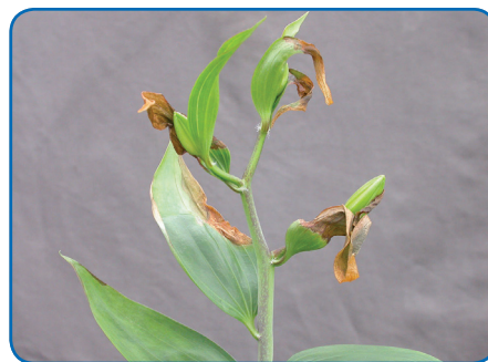
■ LEFT: ULN on ‘Acapulco’ lily. TOP RIGHT: leaves were affected by ULN even when they were still folded. BOTTOM RIGHT: Severe ULN symptoms in late stage.

Star Gazer plants grown from 16/18 cm bulbs begin to exhibit symptoms about 30 days after planting; plants grown from larger bulbs might take as long as 45 days. Once flower buds are visible, the danger of developing additional necrosis is minimal.